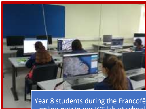
Year 8 students during the Francofête online quiz in our ICT lab at school.